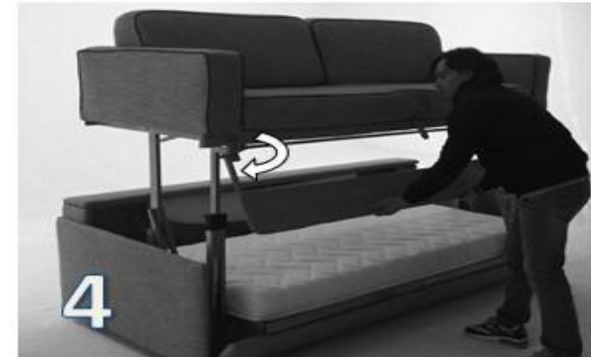
4 Turn the guardrail downwards until its support