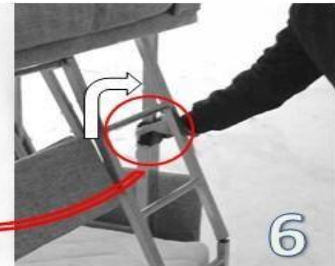
6 Unlock the right safety device by moving it up and forwards keeping it in a tilted position