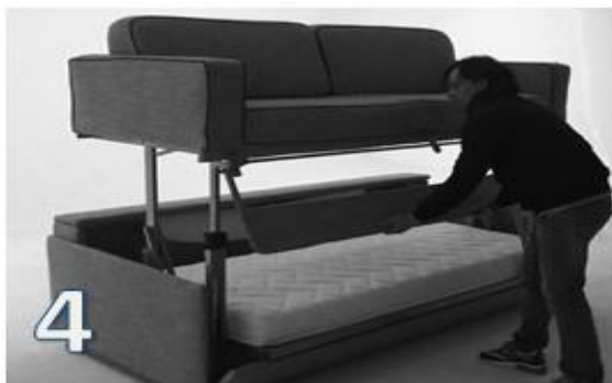
4 Grasp the guardrail