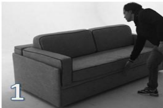
1 Grasp the handle with both hands

Make sure that children are at a safety distance