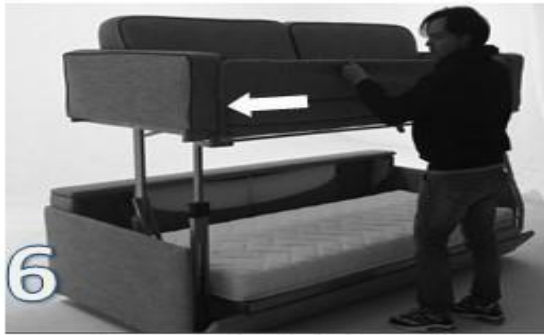
Move the guardrail to the left in order to block it inside the manual safety lock