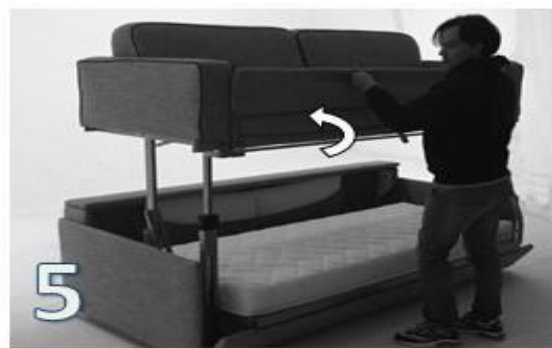
5 Turn the guardrail upwards in order to reach a vertical position.