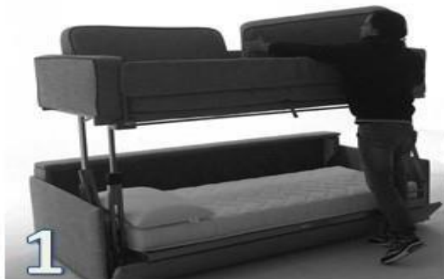
Replace the backrest cushions

Make sure that children are at a safety distance