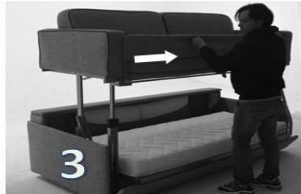
3 Move the guardrail to the right in order to unlock it