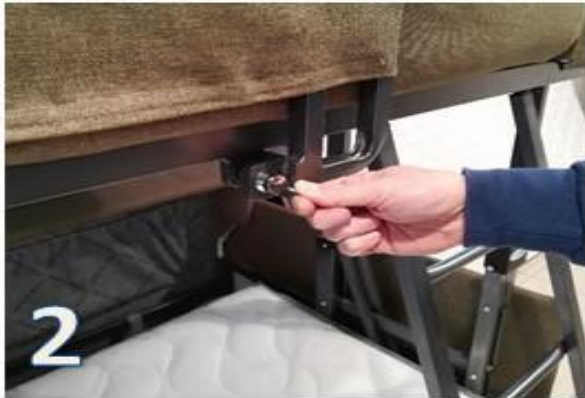
2 Insert the key in the lock and turn clockwise or counterclockwise until the lock is released