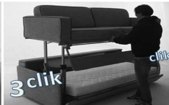
3 Lift up till the bed reaches its upper lock position. A clicking noise on both sides inform that the safety devices are activated. Make sure about it, otherwise do it manually by moving the safety devices into the closed position.