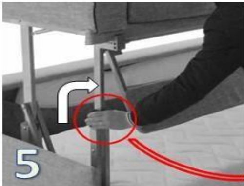
5 Unlock the left safety device by moving it up and forwards keeping it in a tilted position