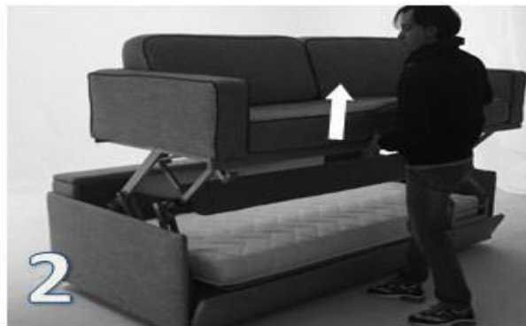
2 Lift up firmly the upper bed of the bunk bed