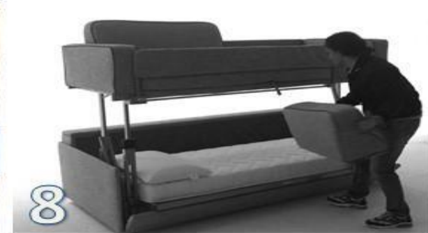
Put the backrest cushions inside its storage space