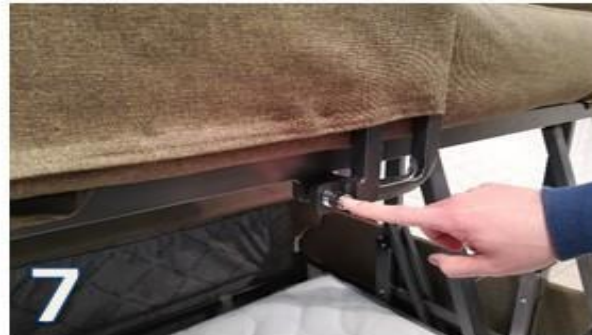
Push the lock to close off the sideboard